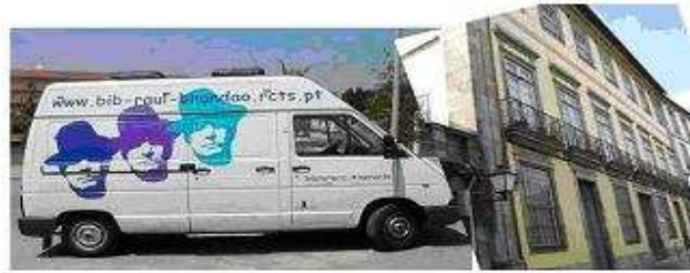
Figure 2. Raul Brandão Library

The theory was formulated before the beginning of the collection of data, and consequently, proposed to aid the questions in the chart composition. The data arrangement was available in five phases: determination of the collecting techniques and registration of data; collection of data; establishment of data analysis techniques; personal direct contacts with the local management and technological tests of applicable programs.