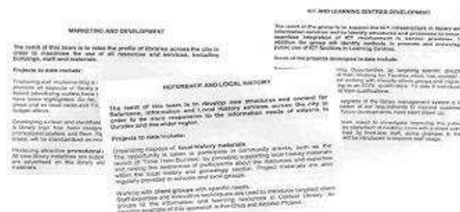
Figure 3. Planning of the Raul Brandão Library's

However, it is necessary to know the different skill combinations. When mobilizing human skills, people will feel better in relation to their activities performed in the organization and, therefore, will produce with greater competence and with a higher level of commitment with the results that could be reached.