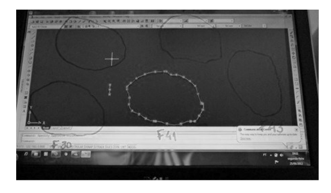
Figure 3. Circumference method by AutoCad® software.

4) Method of circumference by AutoCad<sup>®</sup> (CAD) program. The images of LEA in the transparent film were placed on the computer screen and then outlined with a spline tool (Figure 3). Once linked the initial and final point of the image, the software allowed the determination of the area through its drawing properties. This dimension needed to be converted to the actual size, and the actual distance of one centimeter was measured on the computer screen through the software. This measure was the correction factor for each centimeter, being the dimension determined by the program divided by the correction factor.