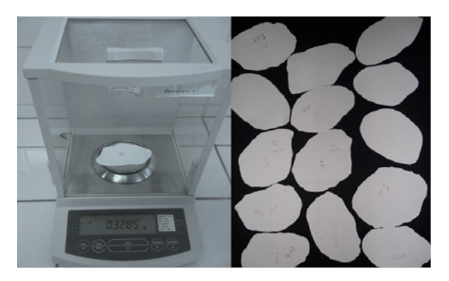
Figure 4. Weighing paper method.

5) Method of weighing paper (WP). A known area of paper (standard) was cut off and its weight (standard weight) determined (Figure 4). After this procedure, the drawing of loin eye area (LEA) was transcripted from tracing paper to the standard paper and, by the ratio between the weight of the sample and the standard, the rib-eye area was measured. In this method it is essential to use gloves, and the samples were kept in vacuum desiccator and weighted on an analytical precision balance in a vertical laminar flow chapel.