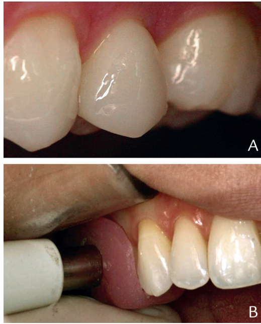
Figure 1. A, Ceramic laminate veneer after cementation. B, Guide for color measurement: window placed on buccal surface to ensure reproducibility of spectrophotometer readings.

The CIELab color change ( \Delta E^*_{ab} ) was calculated according to the following formula 1 :