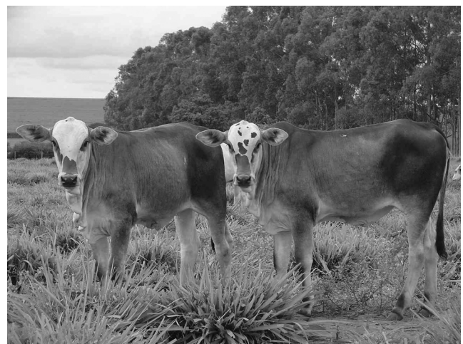
FIG. 1. Twin calves born after transfer of buffalo ooplasm into bovine zygotes.

Comparison between buffalo and bovine mtDNAs showed that they differ by 12% in sequence (based on Genbank sequences, see above), whereas the difference in the replication origin and in the d-loop reaches 7 and 19%, respectively. This may compromise the subsistence of buffalo mtDNA once mitochondrial replication and transcription is initiated, and undermined by inefficient nuclear-mitochondrial interactions. To test this hypothesis we checked whether blastocysts produced by XOT retain the donor mtDNA (Fig. 2). The average number of buffalo mtDNA copies present at the zygote stage was 43,157 \pm 5708 (range: 11,097 to 74,492) and