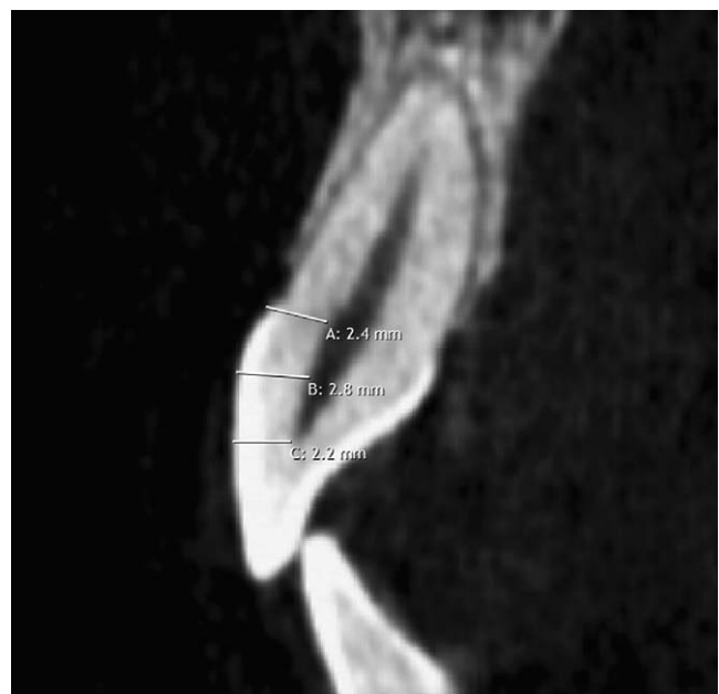
Figure 3. Sagittal reformatted slice of 0.5-mm depth, made in the center of the crown (right central incisor). Lines A, B, and C show the measures of the tooth thickness on the labial face of each tooth.