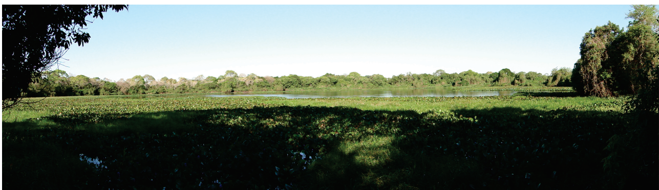
Figure 2. View of Baía da Medalha on Miranda-Abobral Pantanal subregion, in September 2011.

A total of 97 species were recorded (Table 1), representing about 40% of Pantanal fish species (Britski et al. 2007). Resende (2000) recorded 101 fish species belonging to 20 families addressing four floodplain environments in the Miranda River Basin. Catella (1992) recorded a total of 75 species in a pond during the dry season in the Aquidauna subregion, which represents the eastern boundary of the Pantanal. During the same season, Baginski et al. (2007) recorded 95 species in communities of 15 lakes in the floodplain of the Cuiabá River, and Suárez et al. (2001) found a total of 51 fish species in 19 ponds in the Nhecolândia subregion,