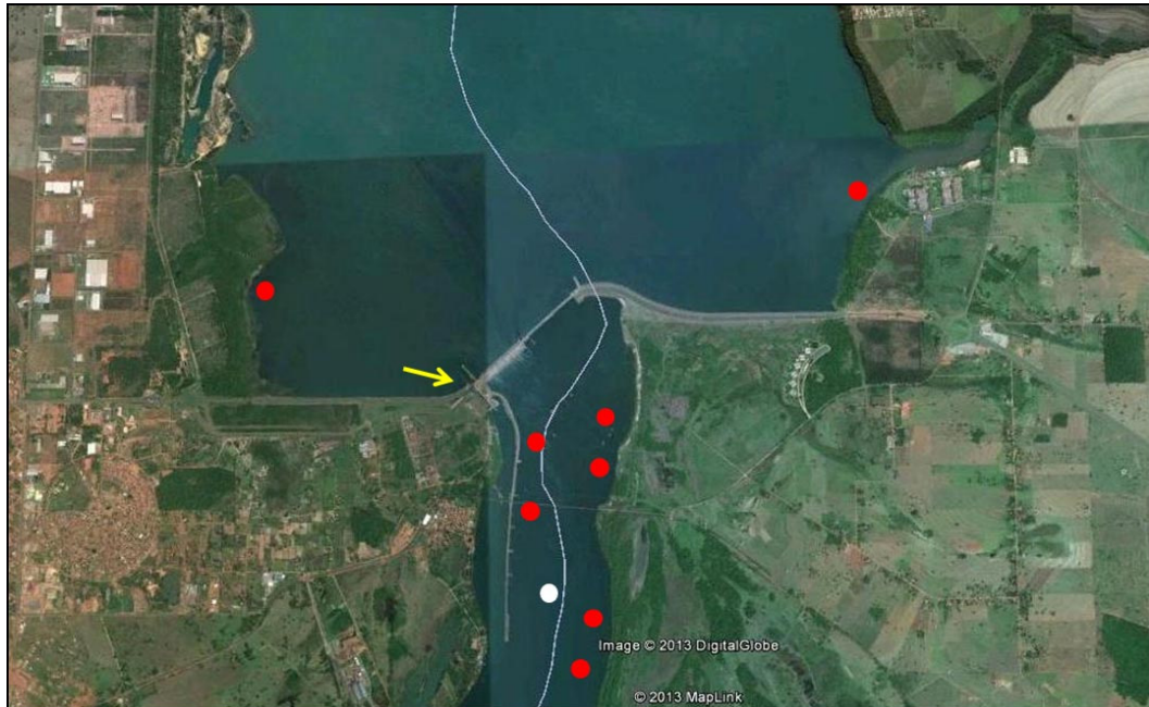
Figure 2. Satellite image of the study area, showing the locations where the potamotrygonid stingrays were released (point in white) and recaptured (points in red). The yellow arrow indicates the position of the navigation lock in the Jupuí Dam.

captured and marked downstream from the Jupuí Dam in September and November 2012. Stingrays were captured using hand nets (called “puçá” by local fishermen) while snorkeling to prevent injuries to the animals, sexed, measured, weighed, fitted externally with t-bar anchor tags (Hallprint© model standard TBA), photographed and then released at the same capture site. Species identification was done in situ, based on the coloration of the animal’s dorsum (following Rosa 1985 and Silva and Carvalho 2011). The sex recognition and sexual maturity of the individuals were based on the presence or absence of claspers (easily observed dorsally) and in previous data on the size of sexual maturity for P. falkneri and P. motoro in the same area (Garrone Neto 2010). Measures were taken to assess the stingrays’ disc width (DW, i.e. the major distance between both pectoral fin margins). In order to enable future verification of the species identification, two additional specimens of each species were collected and stored at the Universidade Estadual Paulista Elasmobranch Collection as voucher-specimens (UNESP-CLP 0010.01, 0010.02).