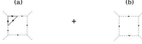
FIGURE 3.1. The Effective Action for the 1LUV of Eq.(2.9) may generate the 4-point function ( figure 5 ) where the dashed line represents the propagation of the heavy \Phi .

diagrams will be first computed in the context of the full theory: