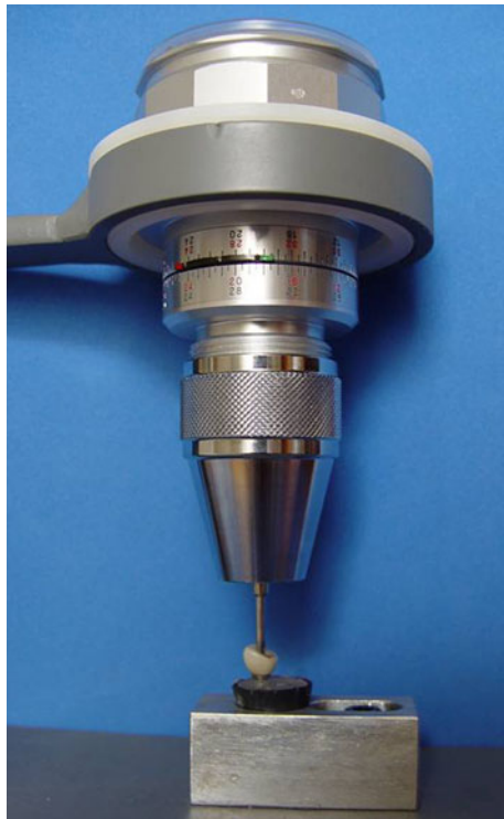
Fig. 2 Analogic torque gauge and specimen positioned in the device for torque insertion and detorque measurement

The groups III and IV exhibited the highest initial vertical misfit values with statistically significant difference ( P < 0.05 ) in comparison to the other groups (Table 1). After mechanical cycling, the groups III and IV maintained the highest vertical misfit values. However, there was no statistically significant difference ( P > 0.05 ) only between group I and groups II and IV (Table 2).