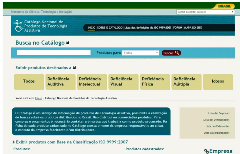
Fig. 1. National Digital Catalogue of Assistive Technology http://www.assistiva.mct.gov.br

New studies on digital interface design consider accessibility in use, taking into account evaluation tools such as those used for usability [13, 14]. In this preliminary study we evaluated the national digital catalogue of assistive technology (CNPTA), which is shown in figure 1.