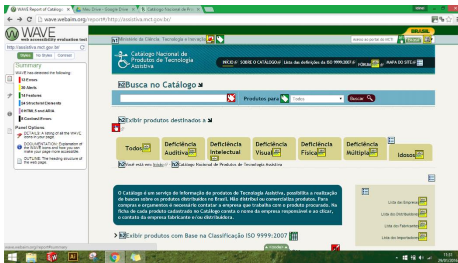
Fig. 3. Results of WAVE test in the initial page of the CNPTA.

Among all the pages the WAVE evaluated the majority of the results are alerts instead of errors. The errors are divided into two types: one error is a missing form label in the main search bar, and; twelve errors are empty links throughout the initial and secondary pages. The latter issues are not directly related to the problems encountered in the user testing. The former, however, can be one of the reasons for the difficulties found by the participants whenever they used the search bar, added to the fault in the searching system itself.