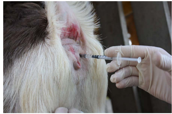
Fig. 1. Cloprostenol administration by latero-vulvar route. A 1 mL syringe coupled to a 0.7 mm × 25 mm needle was used for each animal.

A total of 104 dairy goats (15 Alpine, 38 Saanen and 51 Toggenburg), of eight months to five years old, were used in this study. Goats were kept in an intensive management system, and grouped according to physiological status and milk production in pens housing 10 to 12 goats each (2.5 to 3 m 2 per animal). Goats were fed corn silage and Pennisetum purpureum K. Schum as forage, and balanced concentrate supplement (soy bean, corn and mineral nucleus based mixture). Non-lactating multiparous and nulliparous goats received daily rations of 0.5 kg of concentrate/goat (homemade mixture with 16% crude protein and 68% total digestible nutrients - TDN) and 4.0 kg of chopped elephant grass/goat. Lactating goats received daily rations 1.5 kg of concentrate/goat (homemade mixture with 22% crude protein and 69% TDN) until the attainment of daily milk yields of 3 kg/goat plus 0.33 kg of concentrate for each additional kg of milk produced and 4.0 kg/goat of corn silage. Mineralized salt licks (Salminas Goats®, Nutriplan, Juiz