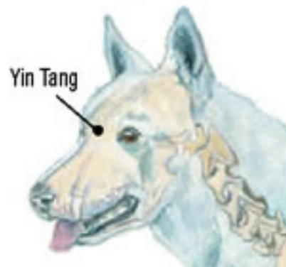
FIGURE 1 - Location of Yin Tang acupoint in dogs. Available from: http://www.animalacupressure.com/page.aspx?id=193

After withdrawal of food and water for 12 and 3 hours, respectively, the dogs were randomly assigned to receive one of the following two treatments, in a double-blind design: the control group (X-IM) received 1mg kg -1 intramuscular (IM) xylazine (Rompum, Bayer do Brazil, São Paulo, Brazil) and pharmacopuncture group (X-Yintang) received 0.1mg kg -1 of xylazine diluted to 0.5 mL of saline solution injected into the Yin Tang acupoint, located on the dorsal midline of the head between the eyebrows (Figure 1).