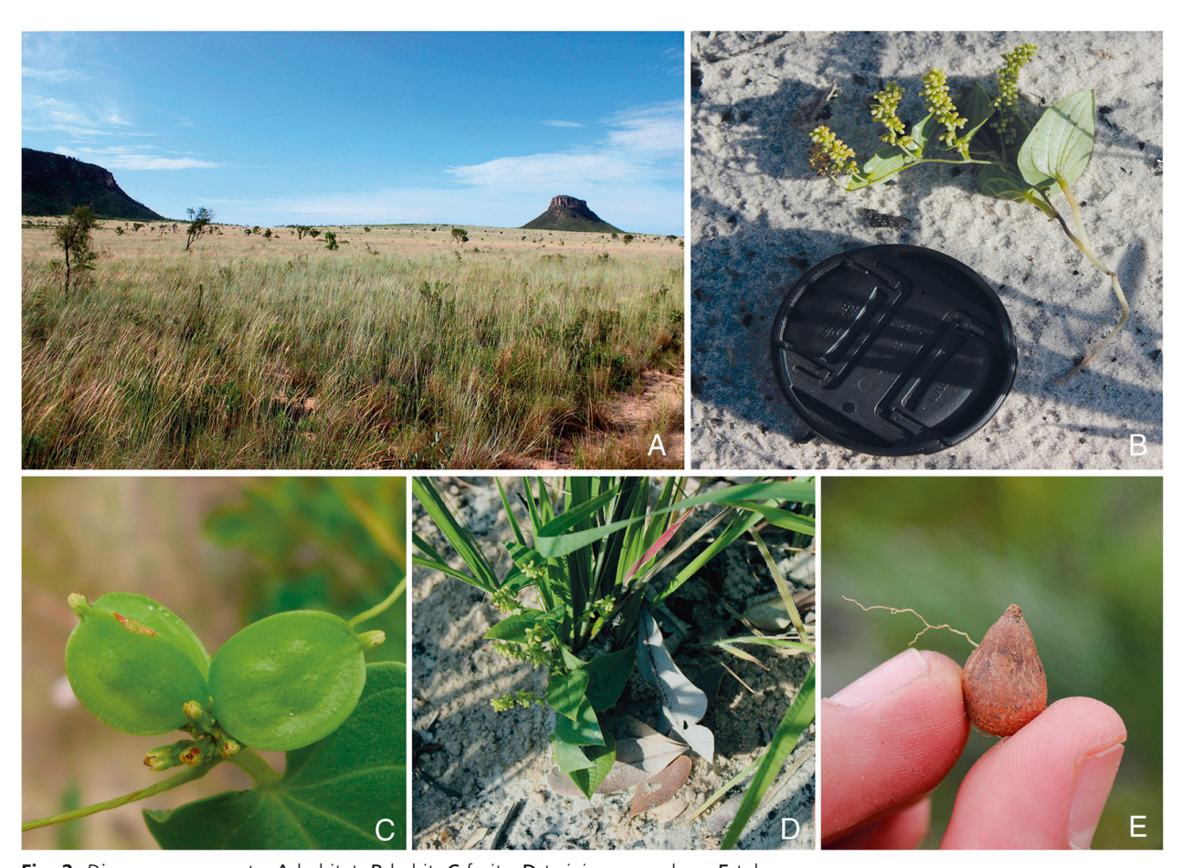
Fig. 2. Dioscorea compacta. A habitat; B habit; C fruits; D twining up sedges; E tuber.

27 Page 4 of 7 KEW BULLETIN (2016) 71: 27