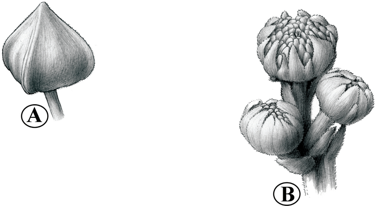
Figure 1. (A) S. lasiocoma flower bud; (B) S. eichleri flower buds.

used to separate some groups of species: S. garckeana and S. petalata , for example, have the ovary covered with a long-velutinous indument with branched hairs (Fig. 3H-I). This type of indument does not occur in other species of the extra-Amazonian region, and although branched hairs are also common in S. uniflora and S. terniflora , the type of indument covering the ovaries in these species is of the short-pubescent type (Fig. 3G, J).