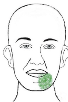
Aspect of the dysesthesia after acupuncture

The patient reported pain during suturing and subsequent removal. While yawning 3 days after the surgery, she felt an acute sensation in the region that developed into a