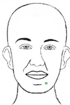
Aspect of the dysesthesia before acupuncture