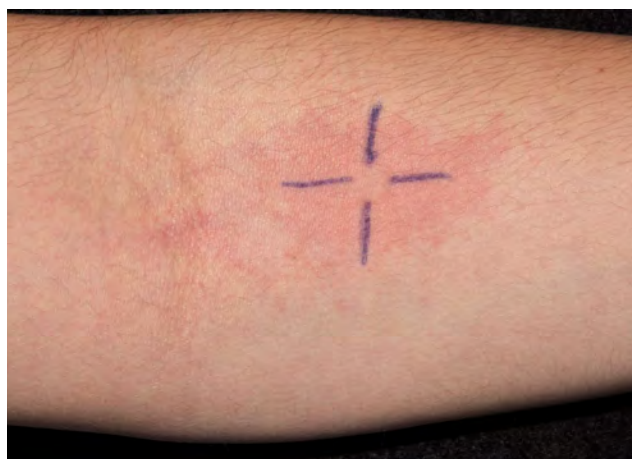
FIGURE 1: Flare and wheal triggered by histamine test. Representation of the measurement of the wheal with a pen

In the subsequent tests, the same procedure was performed two hours after the intake of one of the commercial AH of the following brands: dexchlorpheniramine 6mg (Polaramine), hy-