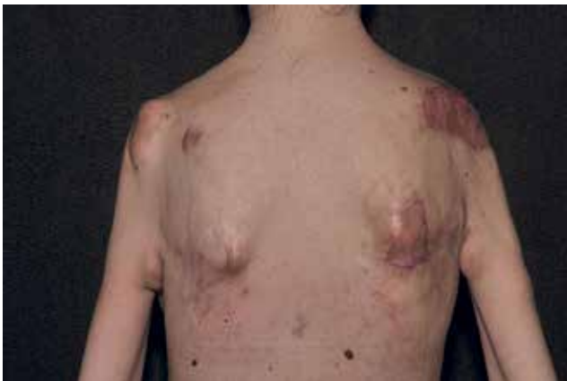
FIGURE 5: Case 2: Tumors on bone eminences of shoulder, shoulder blade and medial face of the arms. Post-excision surgical scars of specific lesions