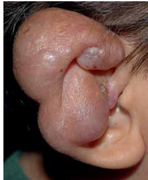
FIGURE 1: Case 1: Erythematous-violaceous nodular tumorous lesion affecting the anatomical structure of auricular pavilion

During follow-up, 20 years after diagnosis, the patient was found to have been developing multiple nodular tumors and undergoing numerous excisions by Plastic Surgery group, with postsurgical relapsing behavior. She has been followed-up due to dermatological and orthopedical symptoms without systemic involvement so far and with diagnosis of JHF (Figures 5 and 6).