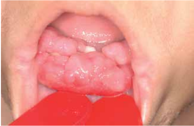
FIGURE 3: Case 1: Intense gingival hyperplasia burying the teeth in lower jaw