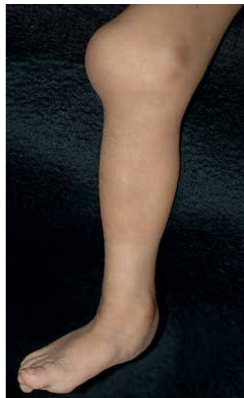
FIGURE 2: Case 1: Tumor formation and deformity of knee and nodular tumorous lesions in ankle and lateral side of foot