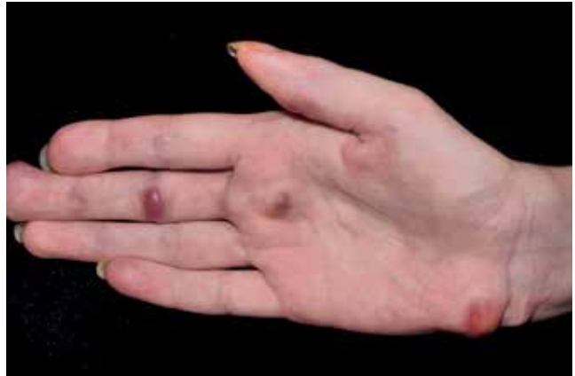
FIGURE 6: Case 2: Erythematous-violaceous tumoral nodular lesions on palm and wrist

The proposal to merge “juvenile hyaline fibromatosis” (OMIM 228600) and “infantile systemic hyalinosis” (OMIM 236490) into a single name, hyaline