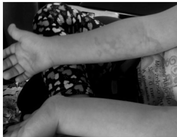
Figure 4 Absence of lesions in the left forearm.

remained unchanged in the first 4 h and, due to the good general condition of the patient, she was discharged at that time. The return to the hospital was requested 12 h later. There was a fading of the most prominent lesions on the ventromedial aspect of the right forearm (Fig. 2), with the appearance of reticular lesions on the same topography and on the dorsal aspect of the right forearm, which reached the back of the right hand (Fig. 3). The patient maintained good general condition and no pain complaints. Once again, the absence of lesions in other topographies was confirmed (Fig. 4). The diagnosis of RL was then established, and explained to the parents that the cutaneous manifesta-