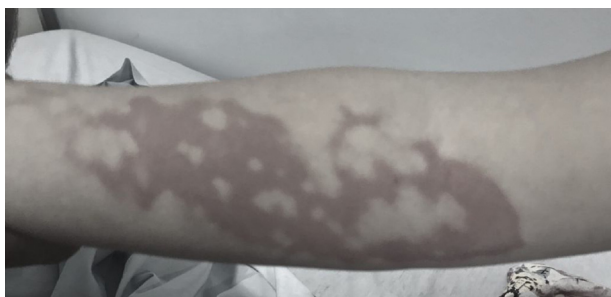
Figure 1 Red-purplish lesion on the ventromedial aspect of the right forearm at the end of anesthesia.