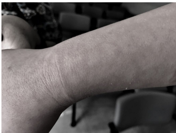
Figure 3 Lesions with reticular pattern on the dorsolateral forearm and right hand, 12 h after hospital discharge.

remained unchanged in the first 4 h and, due to the good general condition of the patient, she was discharged at that time. The return to the hospital was requested 12 h later. There was a fading of the most prominent lesions on the ventromedial aspect of the right forearm (Fig. 2), with the appearance of reticular lesions on the same topography and on the dorsal aspect of the right forearm, which reached the back of the right hand (Fig. 3). The patient maintained good general condition and no pain complaints. Once again, the absence of lesions in other topographies was confirmed (Fig. 4). The diagnosis of RL was then established, and explained to the parents that the cutaneous manifesta-