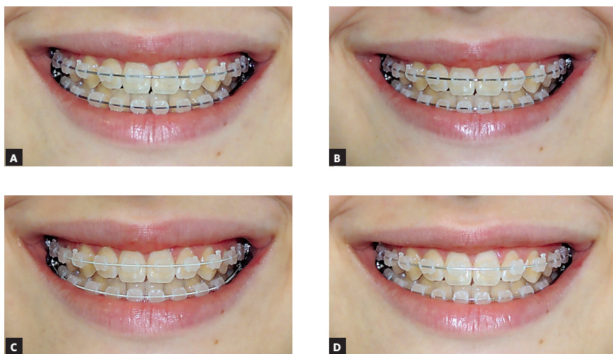
Figure 1 - A) Stainless steel archwire. B) NiTi archwire. C) NiTi archwire coated with epoxy resin. D) NiTi archwire coated with rhodium.