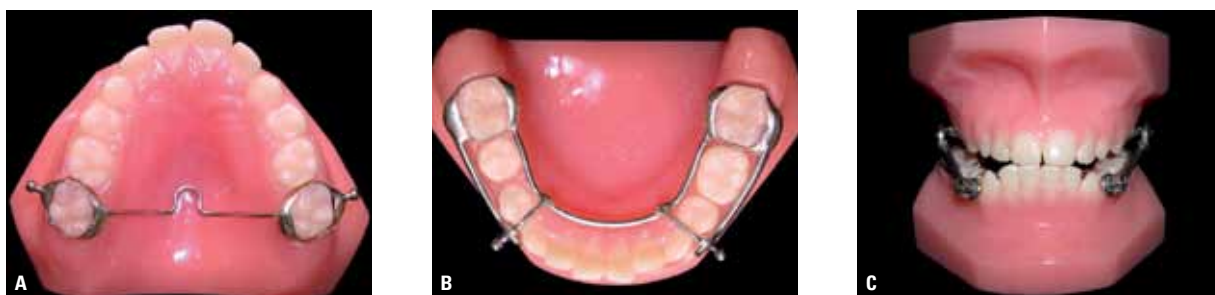
FIGURE 1 - A) Maxillary anchorage system with bands and palatal bar. B) Mandibular anchorage system with bands and cantilever. C) Herbst appliance telescope system after placement.

They were named T1, at 9 years of age, and T2 at age 10. The radiographs were taken in a Keleket device set to 120 kVp, 25 mA and exposure time of 0.3 seconds.