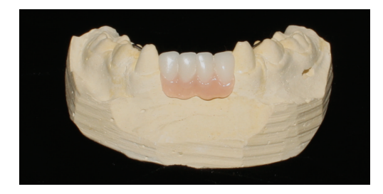
FIGURE 3: Partial dental prosthesis.

The treatment plan involved the installation of an adhesive partial denture for restoring only the lower incisors due to the lack of space for construction of an upper dental prosthesis (Figures 1 and 2). The choice of an adhesive prosthesis was due to the difficulty of the patient's adhesion to use a removable appliance.