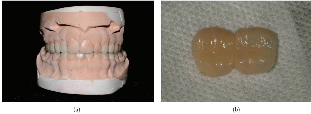
FIGURE 3: (a) Anterior diagnostic waxup. (b) Posterior resin crowns made according to the waxup.