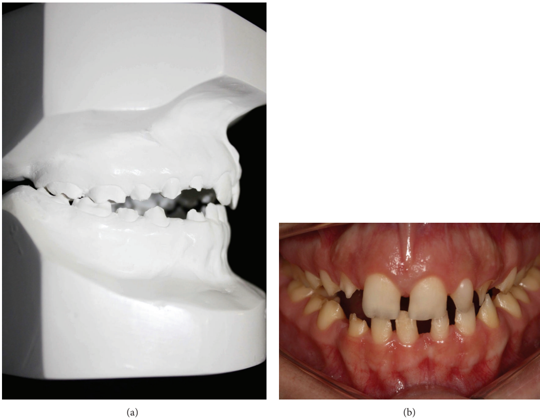
FIGURE 2: (a) The orthodontics appliance. (b) After orthodontic treatment (6 months).

Nowadays, there are several different materials and techniques available to restorative procedures, which have made it both exciting and confusing for dental practitioners. The treatment planning for AI is complex and varies according to the patient's age, symptoms, type and severity of the defect, and the intraoral situation at the time the treatment. Thus, a multidisciplinary approach, which includes pediatric, orthopedic, and operative dentistry, plays an important role in the final result of AI patients. For the ideal treatment, children affected by AI must be analyzed by individual case