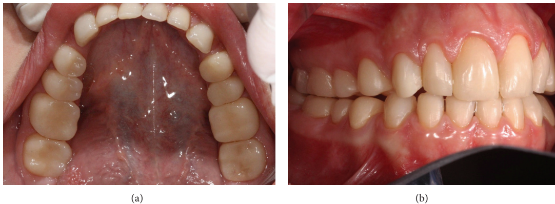
FIGURE 4: (a) Indirect and direct restorations in posterior and anterior lower teeth. (b) Final rehabilitation demonstrating aesthetic and functional result.