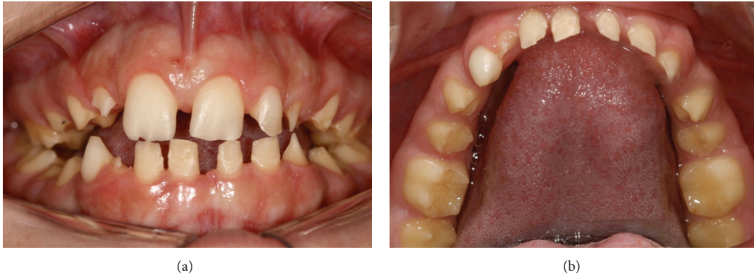
FIGURE 1: Initial intraoral aspect of 8-year-old patient with amelogenesis imperfecta.