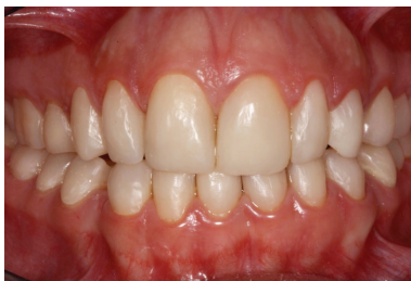
FIGURE 5: Follow-up after 18 months.

minimal wear of the enamel structure with the support of the adhesive systems evolution and resin composite as well [2, 15, 16].