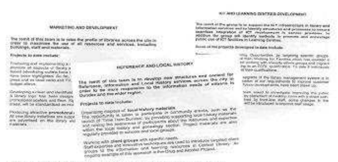
Figure 3. Planning of the Raul Brandão Library's

However, it is necessary to know the different skill combinations. When mobilizing human skills, people will feel better in relation to their activities performed in the organization and, therefore, will produce with greater competence and with a higher level of commitment with the results that could be reached.