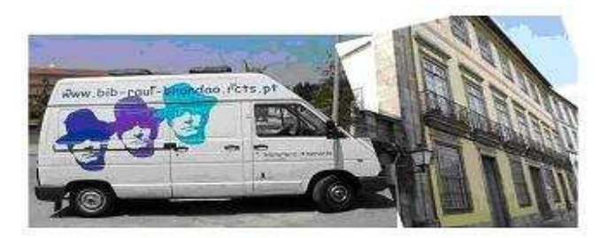
Figure 2. Raul Brandão Library

The theory was formulated before the beginning of the collection of data, and consequently, proposed to aid the questions in the chart composition. The data arrangement was available in five phases: determination of the collecting techniques and registration of data; collection of data; establishment of data analysis techniques; personal direct contacts with the local management and technological tests of applicable programs.