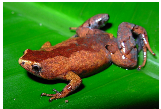
FIGURE 1. Adult female of Arcovomer passarellii (CFBH 19359) from the municipality of Santos, state of São Paulo, Brazil.

During a fieldwork at Sítio São José, municipality of Santos, south coast of São Paulo state (23°51'51.74" S, 46°18'22.57" W), we found an adult female of Arcovomer passarellii (Figure 1). The specimen was found on the leaf-litter, on 6 December, 2007. The locality is 54m above sea level and covered by lowland Atlantic Forest. The voucher specimen (SVL 22 mm) is deposited in Coleção de Anfíbios "Célio F. B. Haddad" (CFBH 19359). This record represents the southernmost register for the species in Brazil and extends the species distribution in approximately 160 km to the southwest of Picinguaba, municipality of Ubatuba (Figure 2).