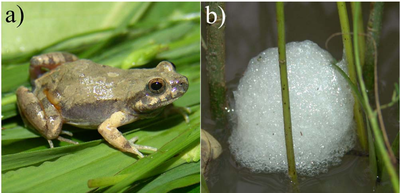
Figure 1. Physalaemus cicada found in the municipality of Nova Russas, state of Ceará; a) adult male, b) nest.