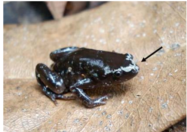
Figure 1. Chiasmocleis albopunctata from the municipality of Matão, São Paulo, Brazil. The arrow shows a white or whitish bar on the snout region, canthus rostralis, and upper eyelid, a diagnostic character of this species according to Caramaschi & Cruz (1997).

Recently, specimens of C. albopunctata were collected in five municipalities of northwestern and one municipality in the westernmost region of the state of São Paulo, filling the distribution gaps in this state (Figure 2). Specimens were identified according to the diagnosis presented by Caramaschi and Cruz (1997) and deposited in the Coleção do Departamento de Zoologia e Botânica (DZSJRP) housed at UNESP, São José do Rio Preto, state of São Paulo, and Coleção Célio F. B. Haddad (CFBH) housed at UNESP, Rio Claro, state of São Paulo.