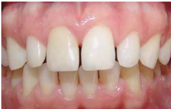
Fig. 1: Initial clinical aspect