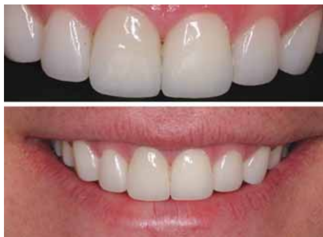
Fig. 8: Clinical aspect of the contact lens after 3 years of follow-up

In this study, the fragments of thin veneers were chosen to close the patient's diastemas. The dental preparation of this