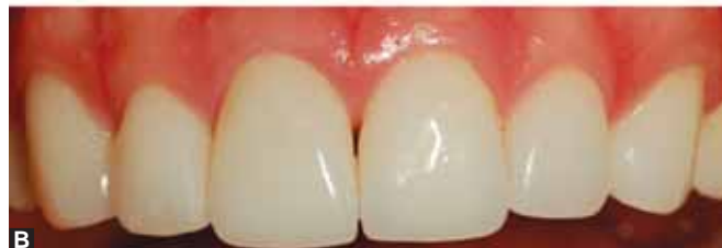
Figs 7A and B: Clinical aspect of the contact lens: (A) Try-in; (B) Final aspect after contact lens cementation

tissues remained healthy (Fig. 8). The patient considered the treatment outcome both esthetically and functionally satisfactory.