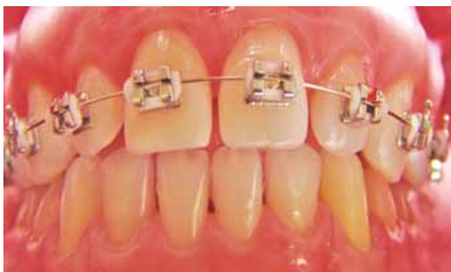
Fig. 2: Fixed retainer installed

invasiveness, esthetic results, clinical time and cost. The patient chose rehabilitation with contact lens of thin porcelain veneers. The driving forces toward patient's decision were that contact lens of thin porcelain veneers provide a durable, stain-resistant surface and conserve the dental structure.