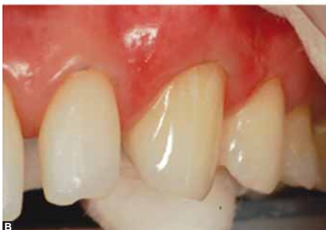
Figs 6A and B: Teeth preparation to receive the contact lens: (A) Phosphoric acid application; (B) adhesive application