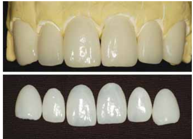
Fig. 5: Laboratorial aspect of the contact lens

A dual-curing luting agent (Variolink, Ivoclar Vivadent AG, Schaan, Liechtenstein) was mixed and applied to the internal surfaces of the veneers. The veneers were placed on the prepared teeth and held in place. A slightly photo-