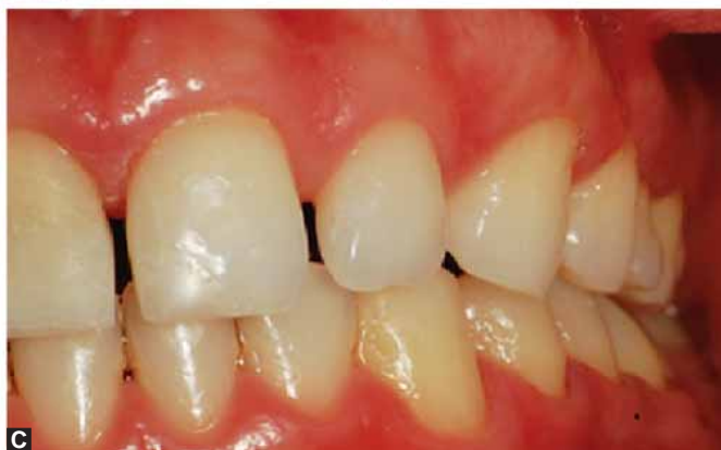
Figs 3A to C: Clinical aspects of the prepared teeth: (A) Frontal view; (B) right lateral view; (C) left lateral view