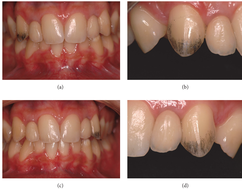
FIGURE 4: Different view of the guide of selective enamel recontouring of canine maxillary. (a) Marking on the most prominent third of the buccal face of tooth #13. (b) An approximate view of the teeth after enamel recontouring. (c) Marking on the most prominent third of the buccal face of tooth #23. (d) An approximate view of the teeth after enamel recontouring. Note on the proximal saliencies, greater wear was performed in the cervical direction in order to prevent them from remaining more projected and therefore outstanding in the smile.