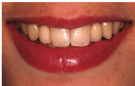
FIGURE 5: Final aspect after performing the finishing and polishing procedures, in which more harmonious and rounded contours, more in keeping with the patient's face and gender, may be observed.

accordance with the manufacturer's instructions and light-activated using a light emitted diode unit (Bluephase, Ivoclar-Vivadent, Schaan, Liechtenstein).