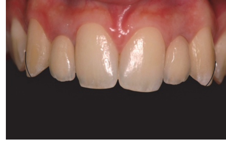
FIGURE 3: Frontal view of selective enamel recontouring of canine maxillary using a guide in order to reduce the buccal inclination, especially in the incisal third, and obtain an incisal angle more rounded.