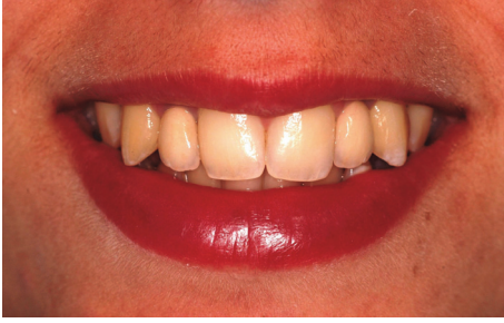
FIGURE 1: Initial clinical aspect showing the relationship between sharp maxillary canines and lips. Incisal thirds of the canines are projected in the vestibular direction, compromising tooth alignments and the harmony of smile.