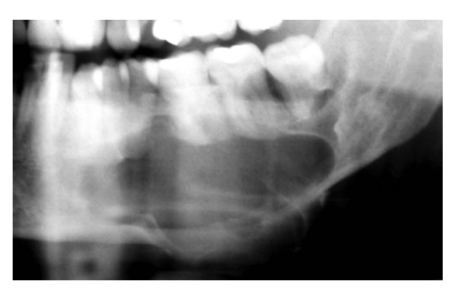
Figure 3: The panoramic radiography shows a large radiolucent and well-defined lesion with a radiopaque corticates margin involving the left mandibular premolar and molar area.

The patient was sent to a Maxillofacial Surgery Department and after the clinical and laboratorial routine examinations, a vigorous curettage washed with Carnoy solution as well as an ostectomy and removal of all the osseous spiculae before the marsupialization was done. A resin obturator was made and was fixed in the mucosa by suture in order to not allow the closure of the mucosa and to permit the patient to clean the